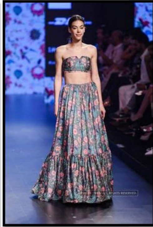
Payal Singhal's "Sitara" collection